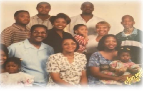
I thought of all the yesterdays The good ones and the bad, I thought of all that we shared, And all the fun we had.

If I could relive yesterday, Just even for a while I'd say good-bye and kiss you, And maybe see you smile.