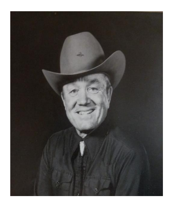
Psalm 121 (NKJV)

I will lift up my eyes to the hills— From whence comes my help? My help comes from the Lord, Who made heaven and earth.