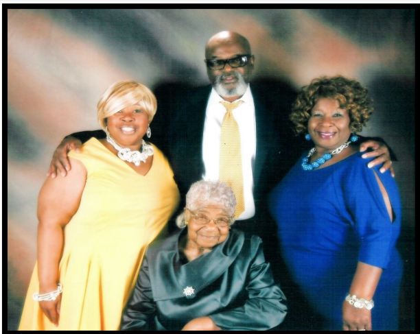
Gone but, Never Forgotten