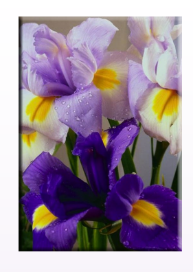
Flower Attendants Great-grandchildren

The Family gratefully acknowledges and appreciates your kind expressions of love and sympathy during this difficult time. May God continue to bless and keep you